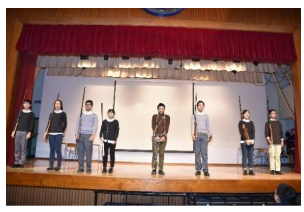
Drama Club Performance